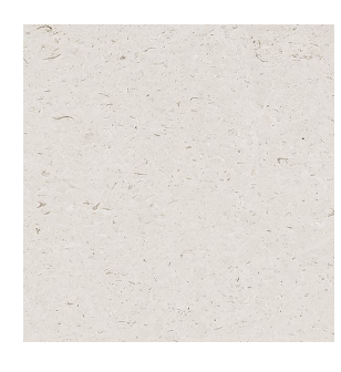
Heritage Portland Stone ®